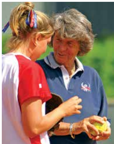
Women’s softball coach at Florida Atlantic University.

Many consider her as “The Greatest Woman Athlete of All Time.” Her jaw-dropping achievements/honors take pages to list, including 20 Hall of Fame inductions, Connecticut Athlete of the Year (selected by the Connecticut Sports Writers Alliance), and a softball field renamed Joan Joyce Field (a part of Municipal Stadium in Waterbury).