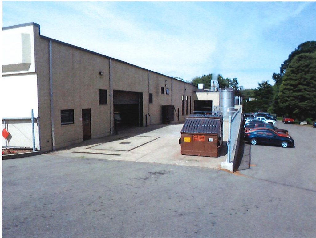
North side of Site Building. Location of USTs behind building, view looking west.