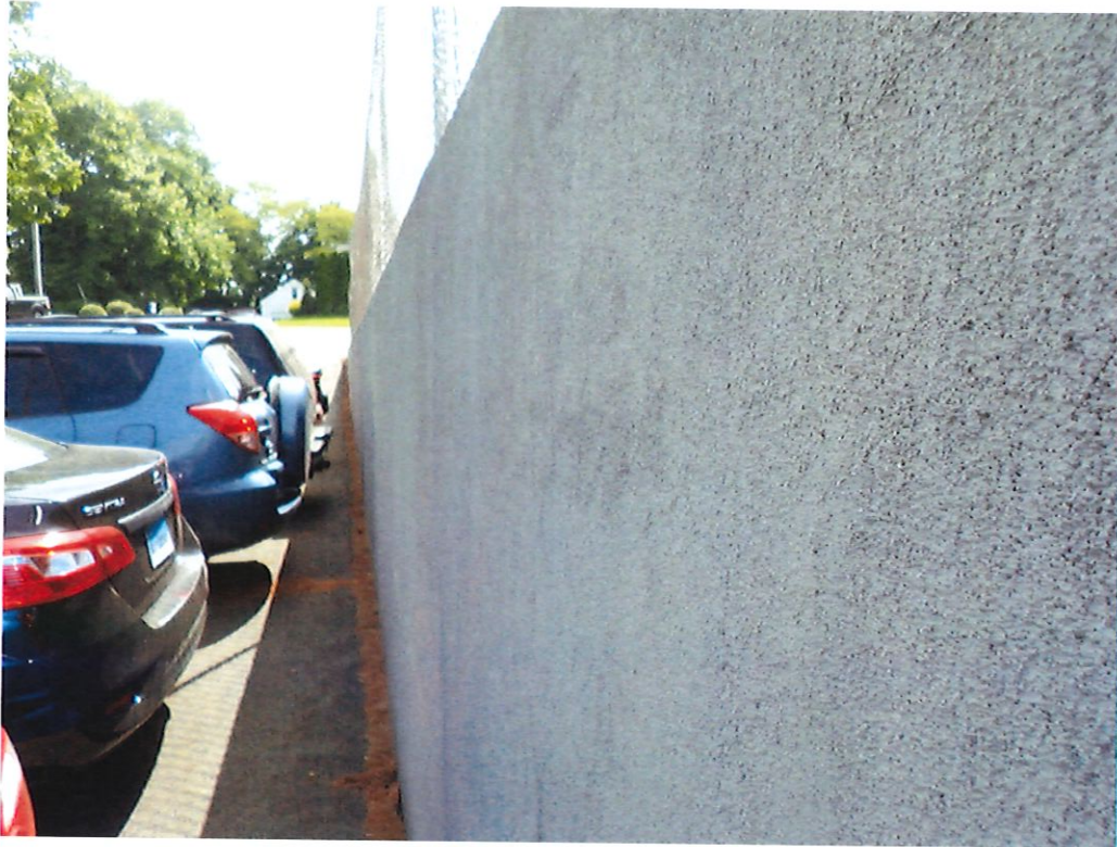
Concrete vault wall, view looking east.