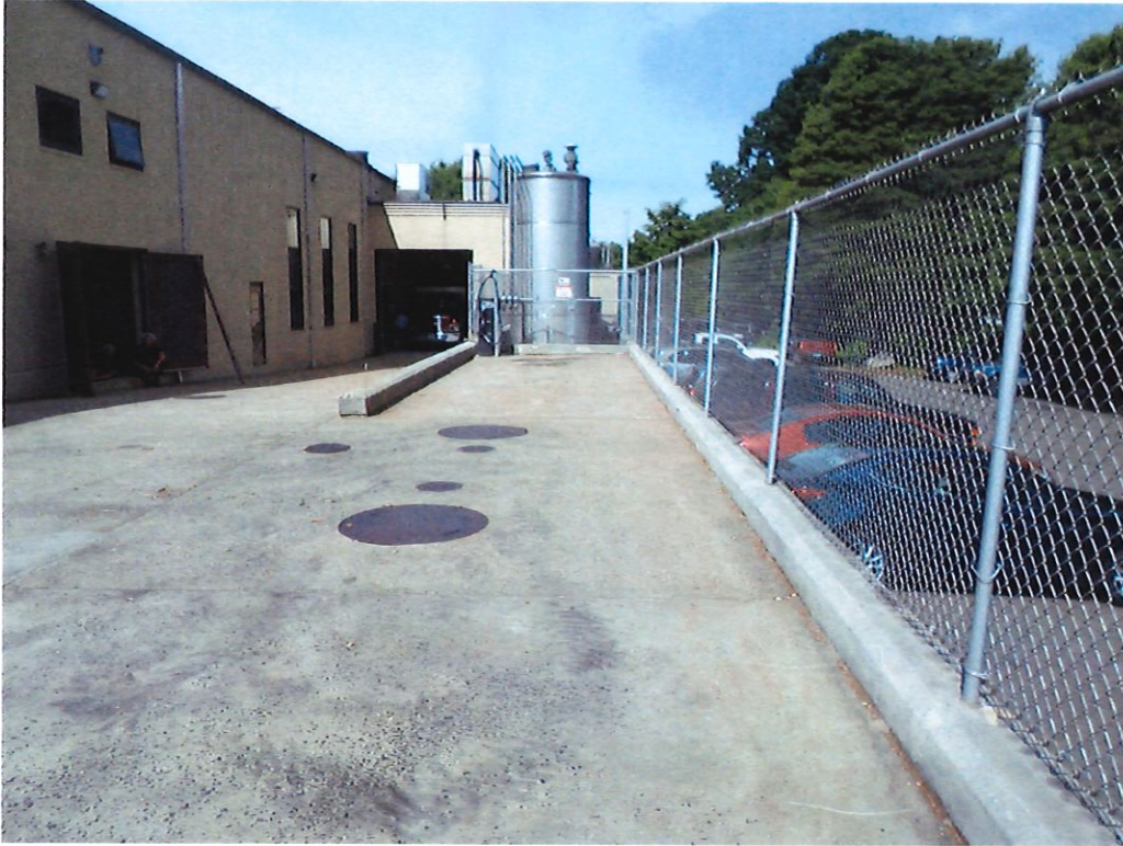
USTs in concrete vaults, view looking west. USTs end to end in vaults.