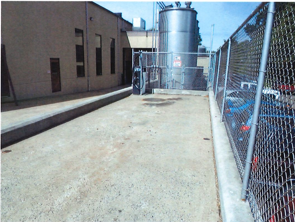
Gasoline UST in concrete vault above grade, dispenser & manhole, looking west.