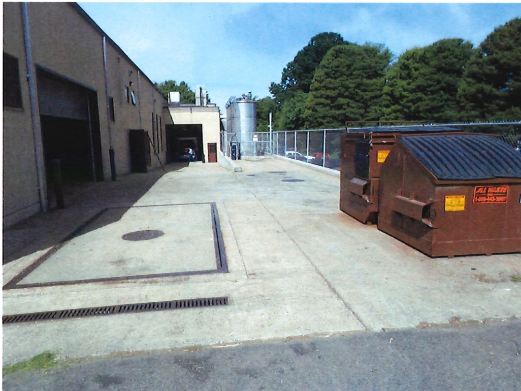
Two 10,000-gal. fuel oil, & one 3,000-gal. gasoline USTs, right side of concrete pad.