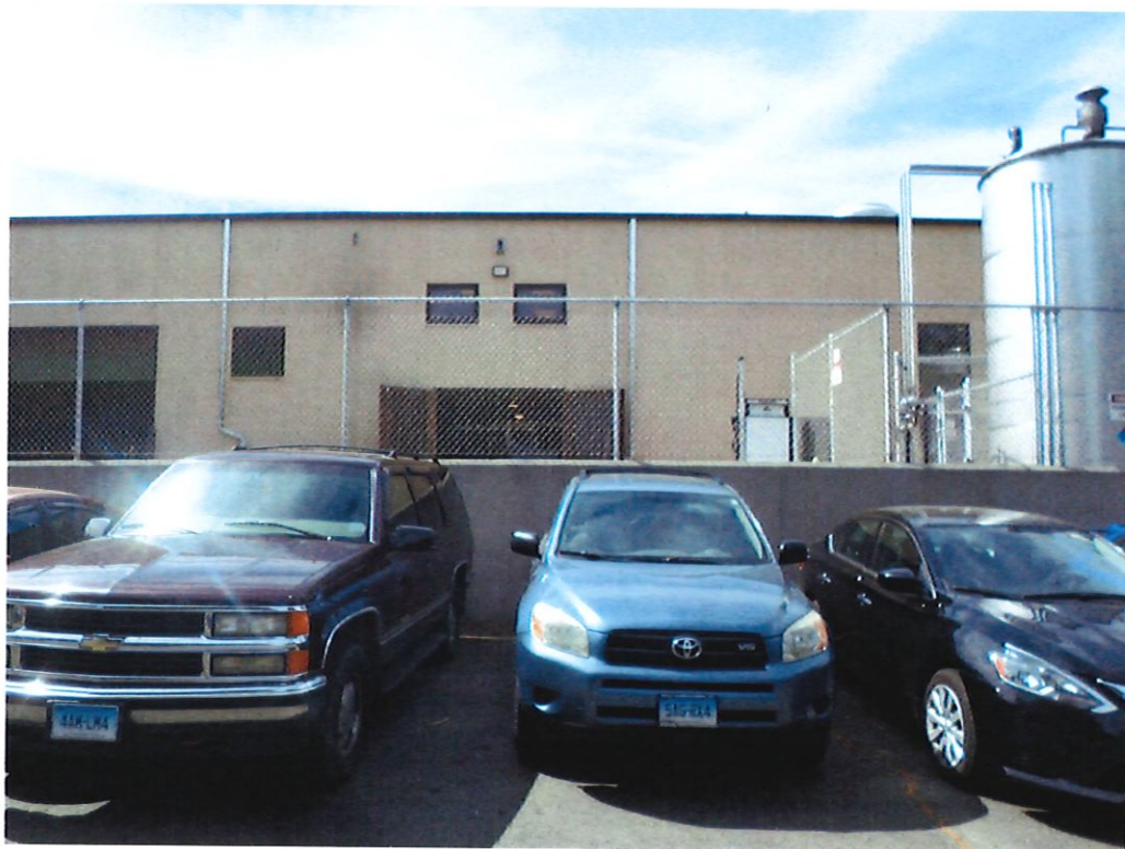
Concrete vault wall.