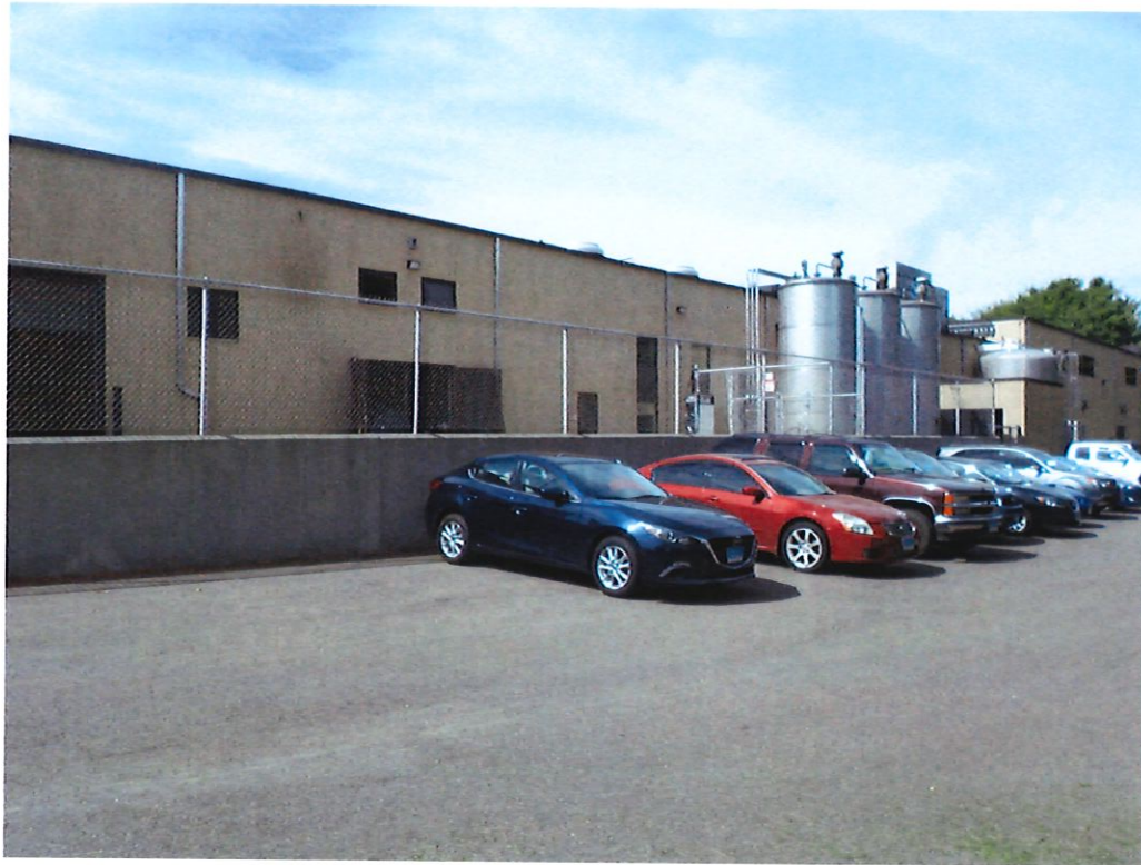
Exterior concrete vault wall, view looking southwest.