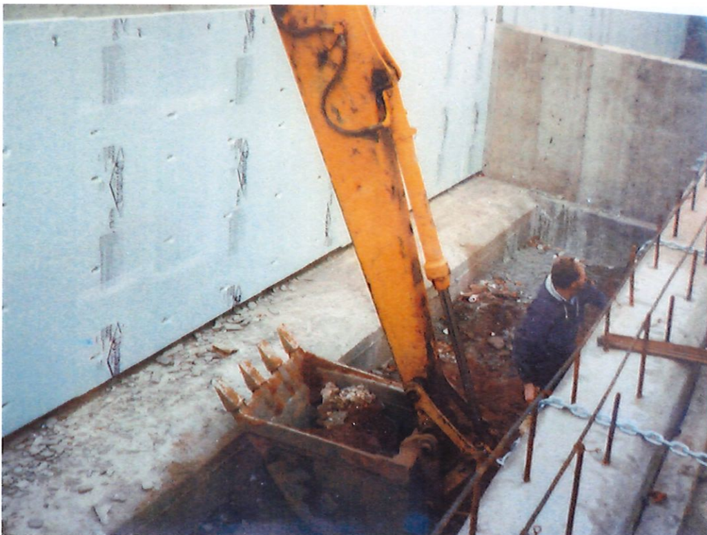
Historical photo, construction of concrete vaults for three (3) USTs.