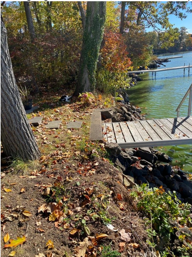
Proximity of mature trees to eroded edge. Wide strip of vegetation to be planted with clover and native plants