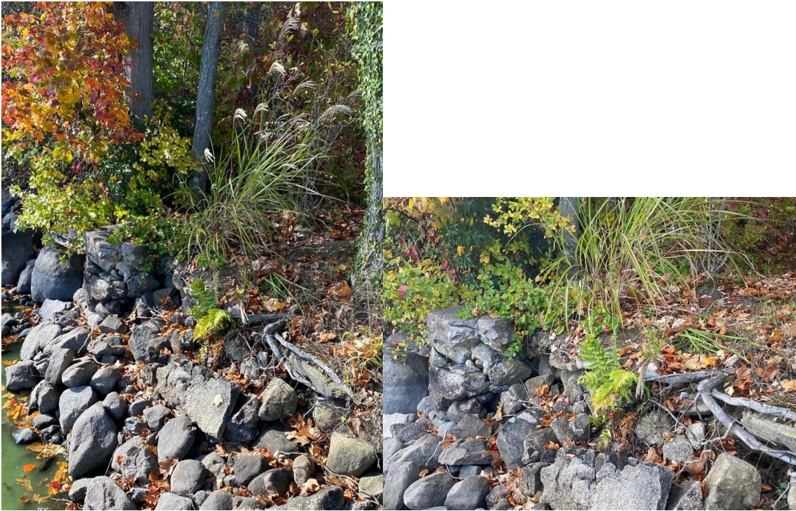
Existing edge of old seawall, note tree roots exposed due to erosion