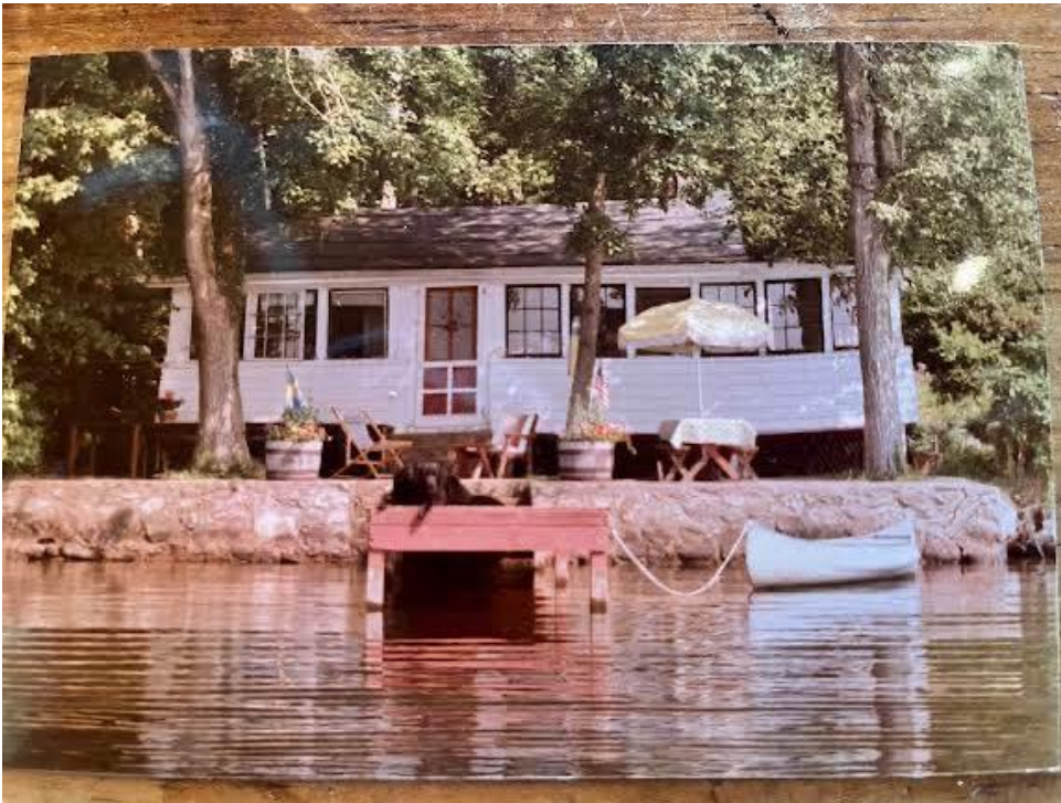
Photo of the original house and seawall, circa 1990

RECEIVED 10.27.2021 East Hampton Land Use Office