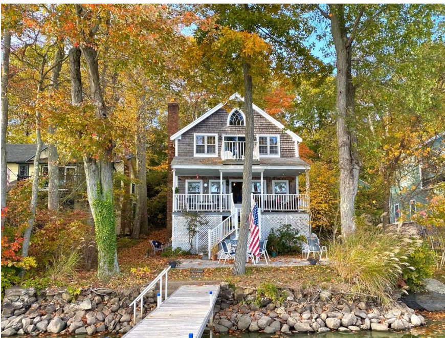
Photo of current house and eroding land. See photos below to see exposed tree roots. We are concerned about losing the large, mature trees to erosion

Original home had a poured cement patio and cement/stone seawall with no vegetation border in front of the seawall