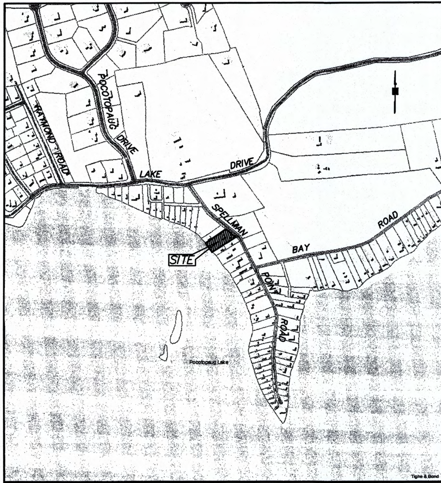
SITE LOCATION MAP SCALE: 1"=500'