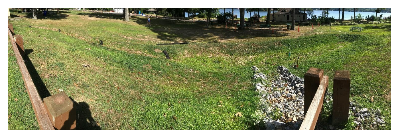
Figure 2 bioretention system #1 Sears Park