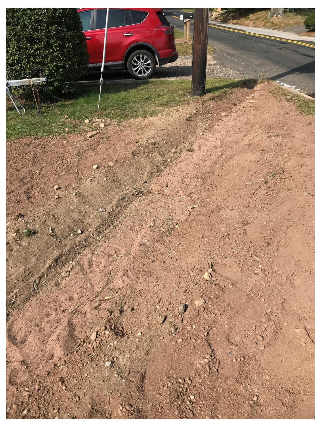
Figure 10 Vegetative swale on Clark hill leading to bioretention system