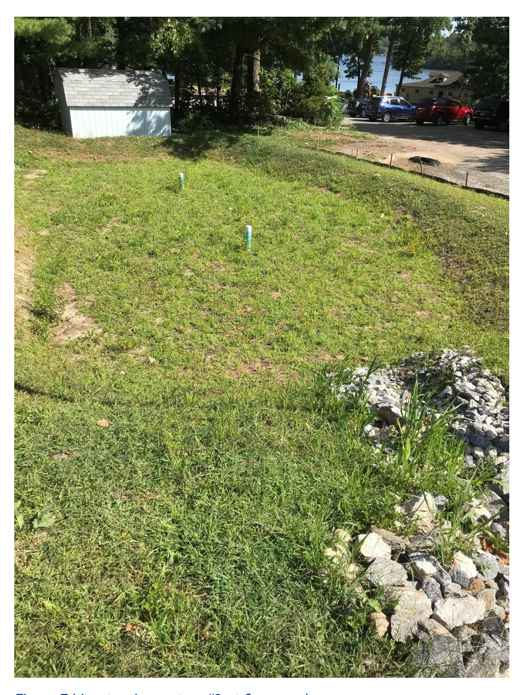
Figure 7 bioretention system #2 at Sears park