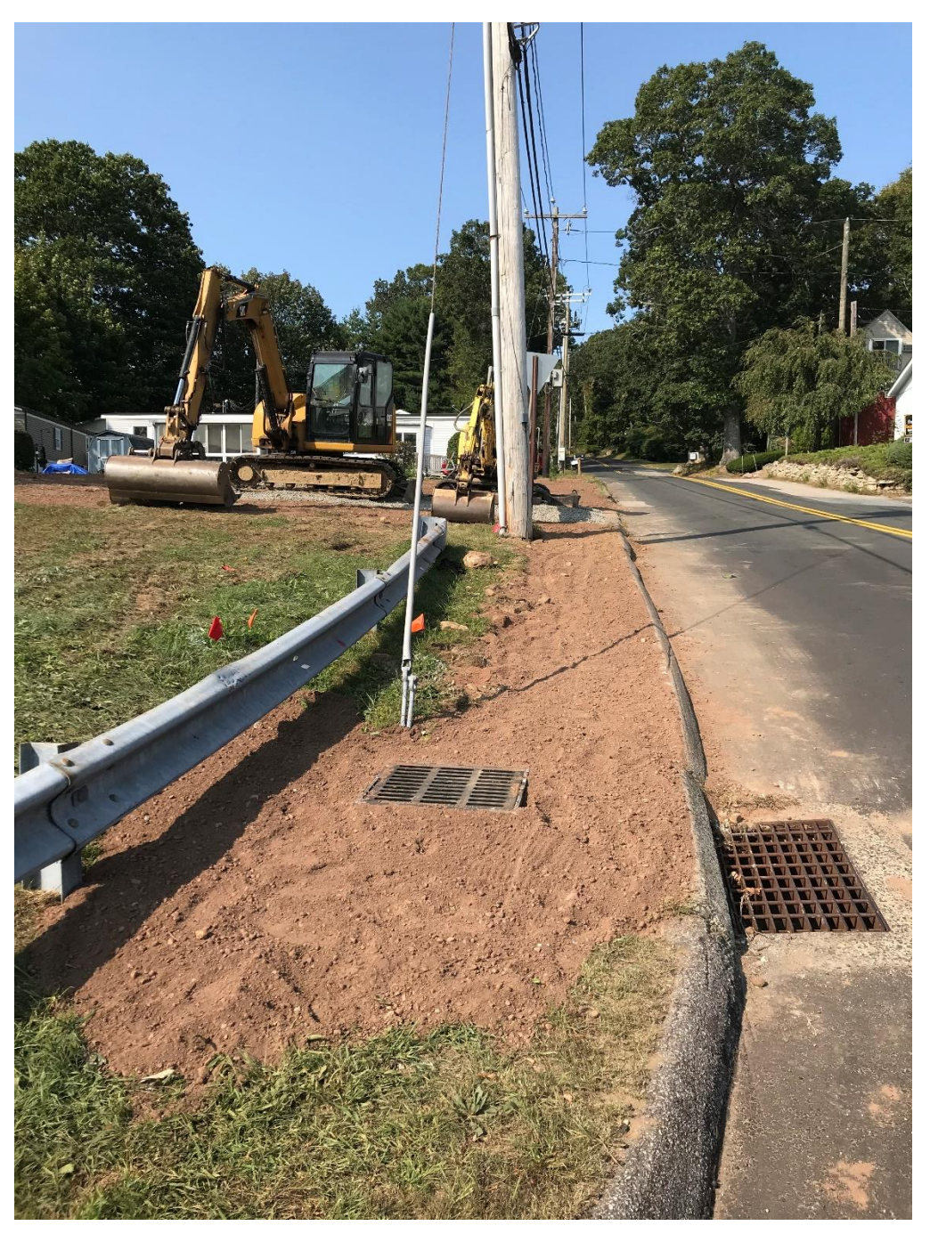
Figure 12 Overflow discharge to storm drain on Clark Hill