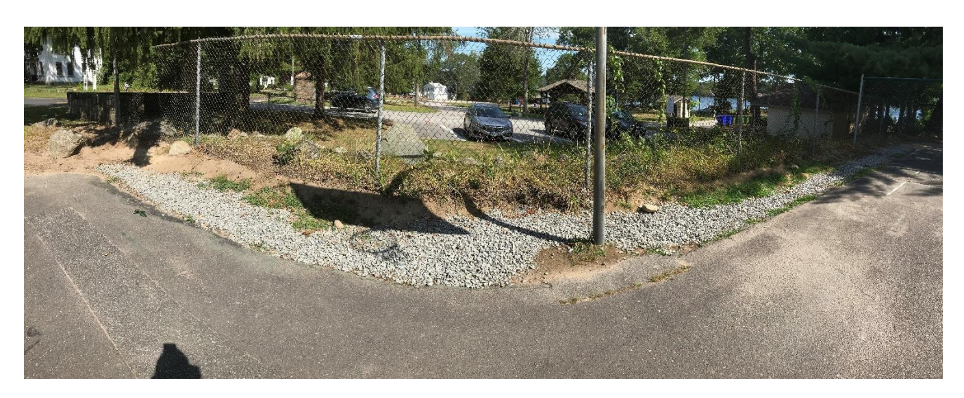
Figure 5 underdrain for bioretention system #2 at Sears Park