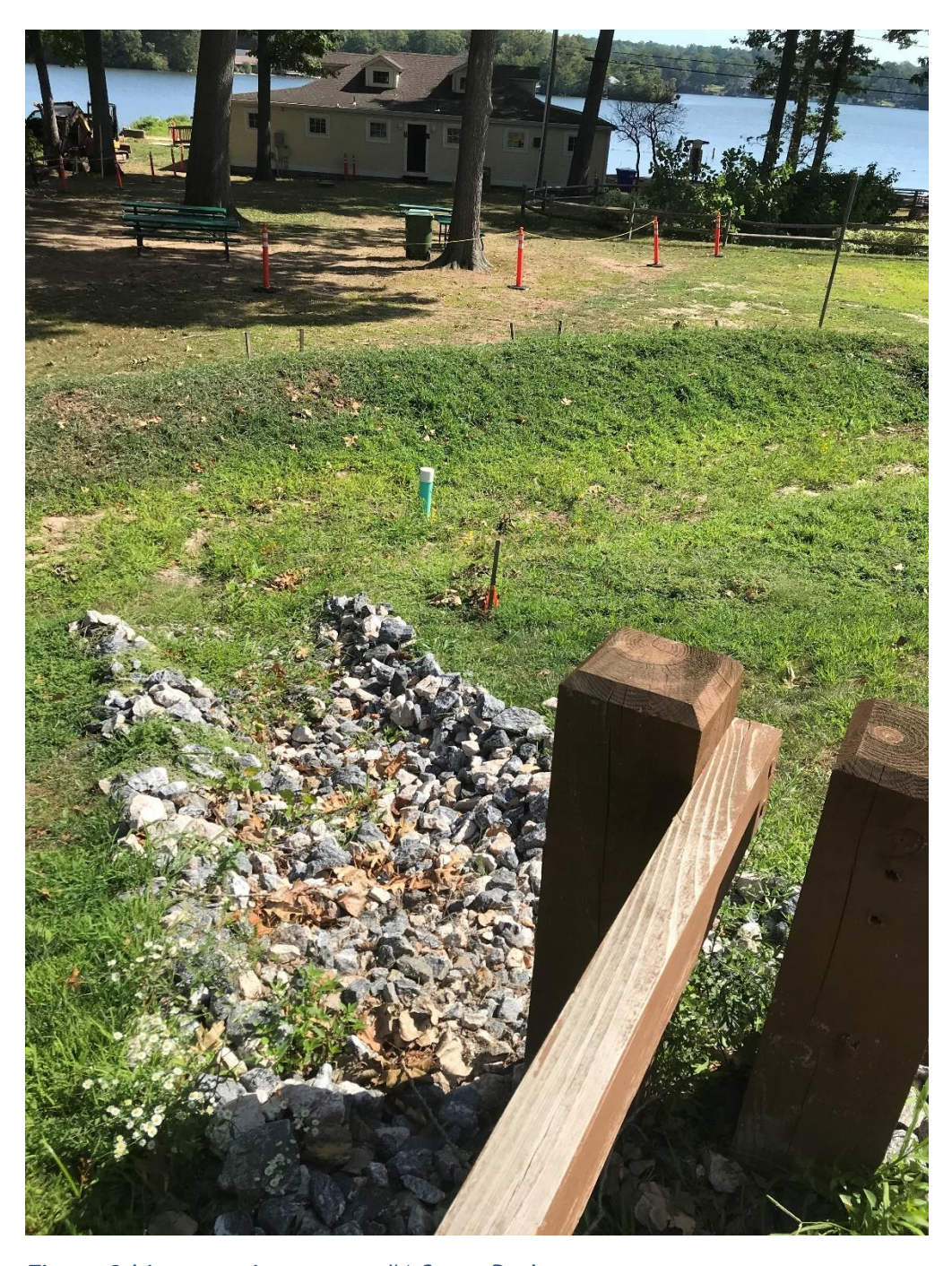
Figure 3 bio retention system #1 Sears Park