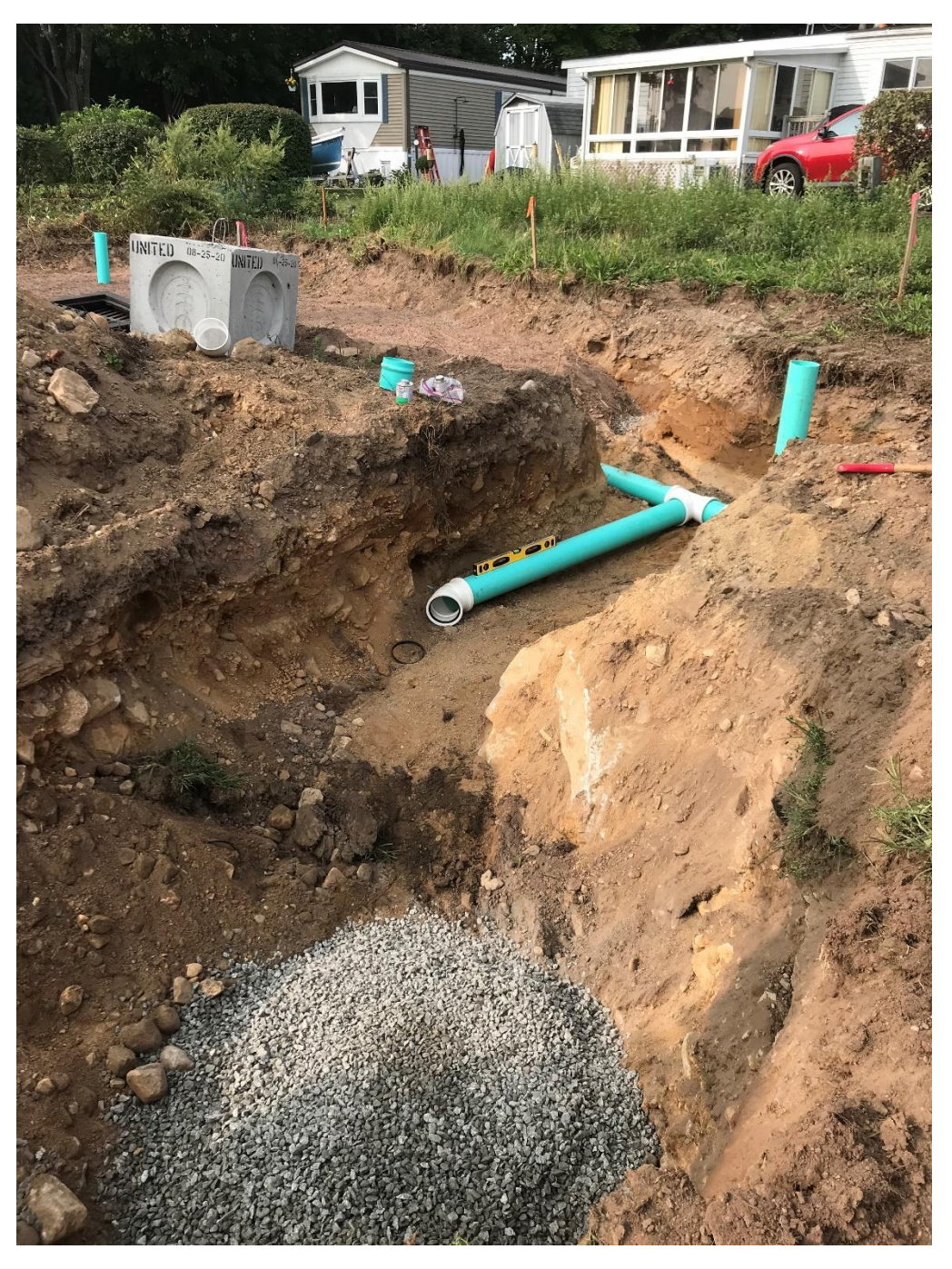
Figure 13 Underground discharge pipes on Clark Hill