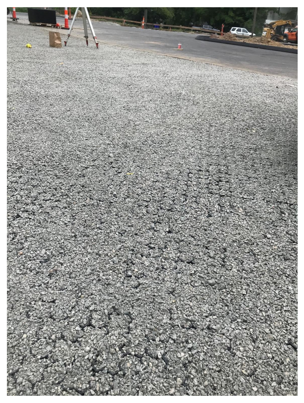
Figure 4 paver system at boat launch