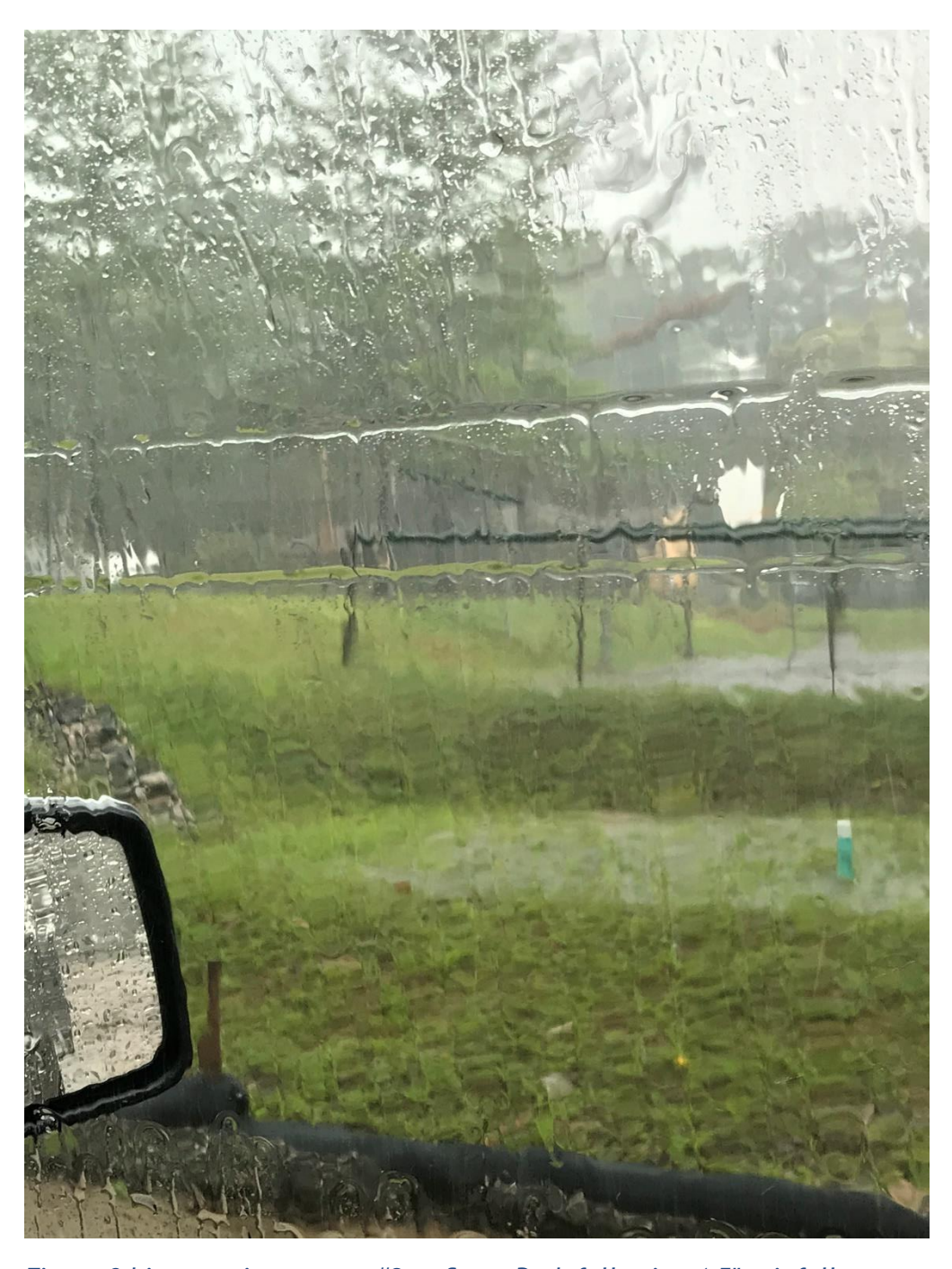
Figure 9 bioretention system #2 at Sears Park following 4.5" rainfall