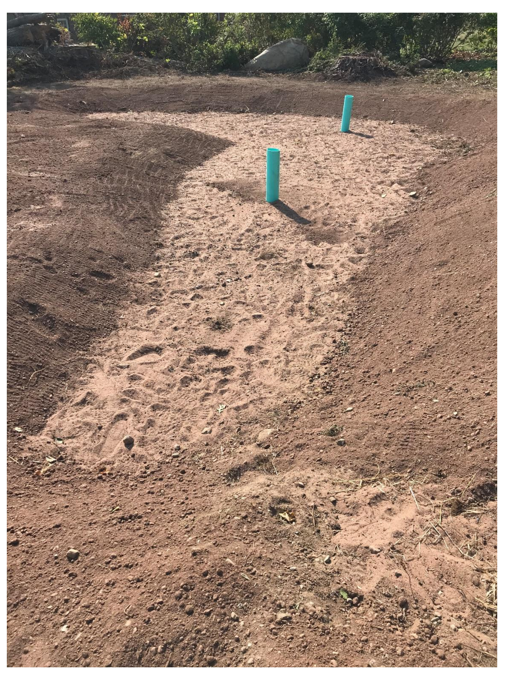
Figure 11 Bioretention system on Clark Hill (pre seed)