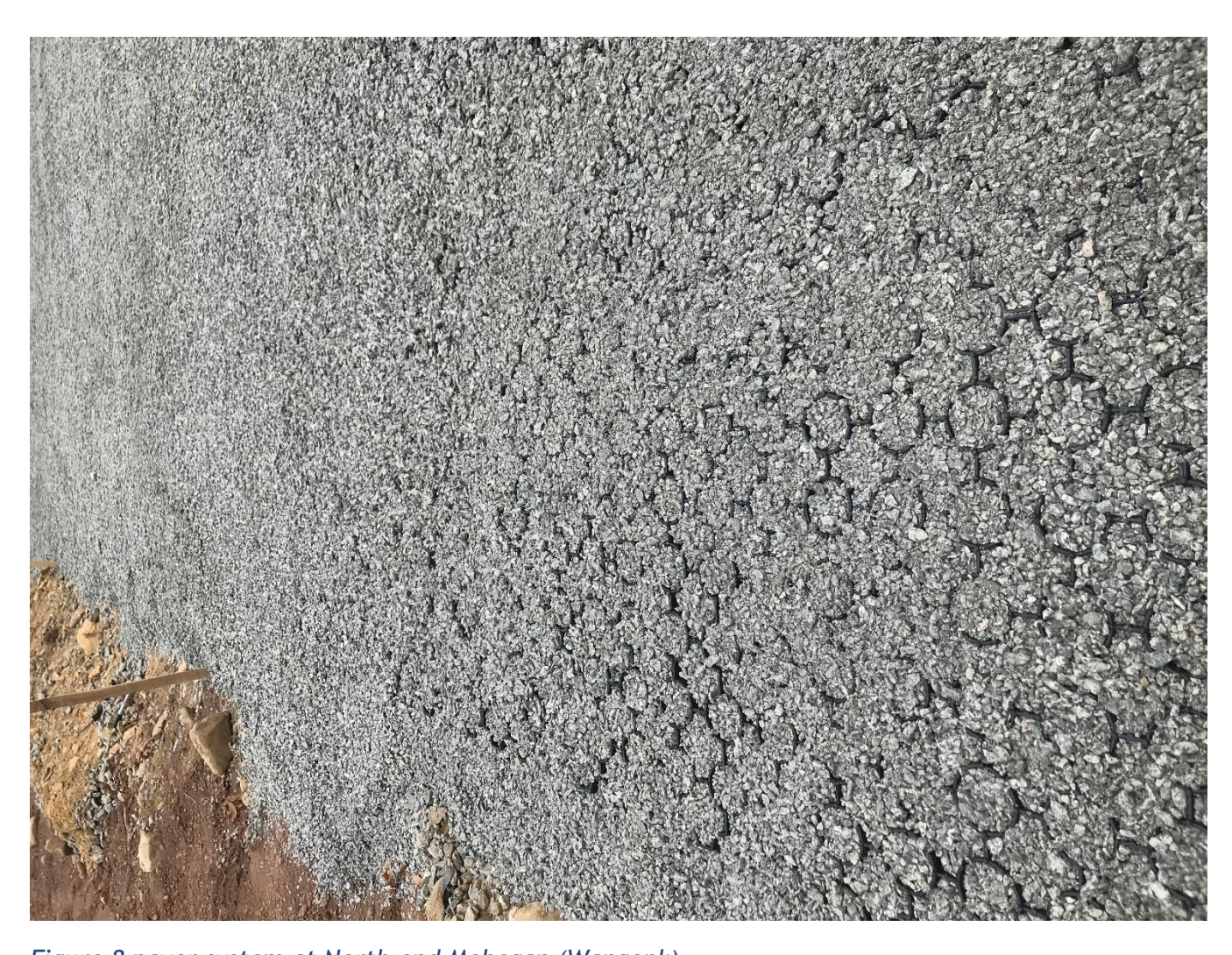
Figure 8 paver system at North end Mohegan (Wangonk)